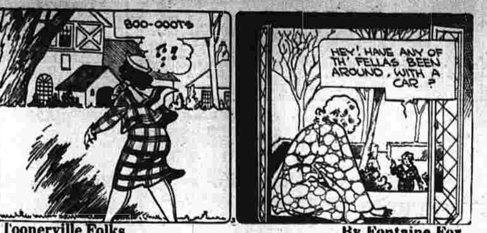
By Fontaine Fox